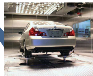
ABH type 4Poster Driving Simulator