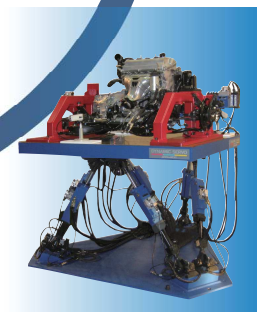
CVH type 6DOF Vibration Test System