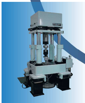
KCH type Elastomer Test System