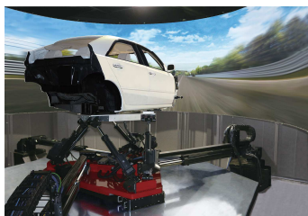
DiM Type New Driving Simulator